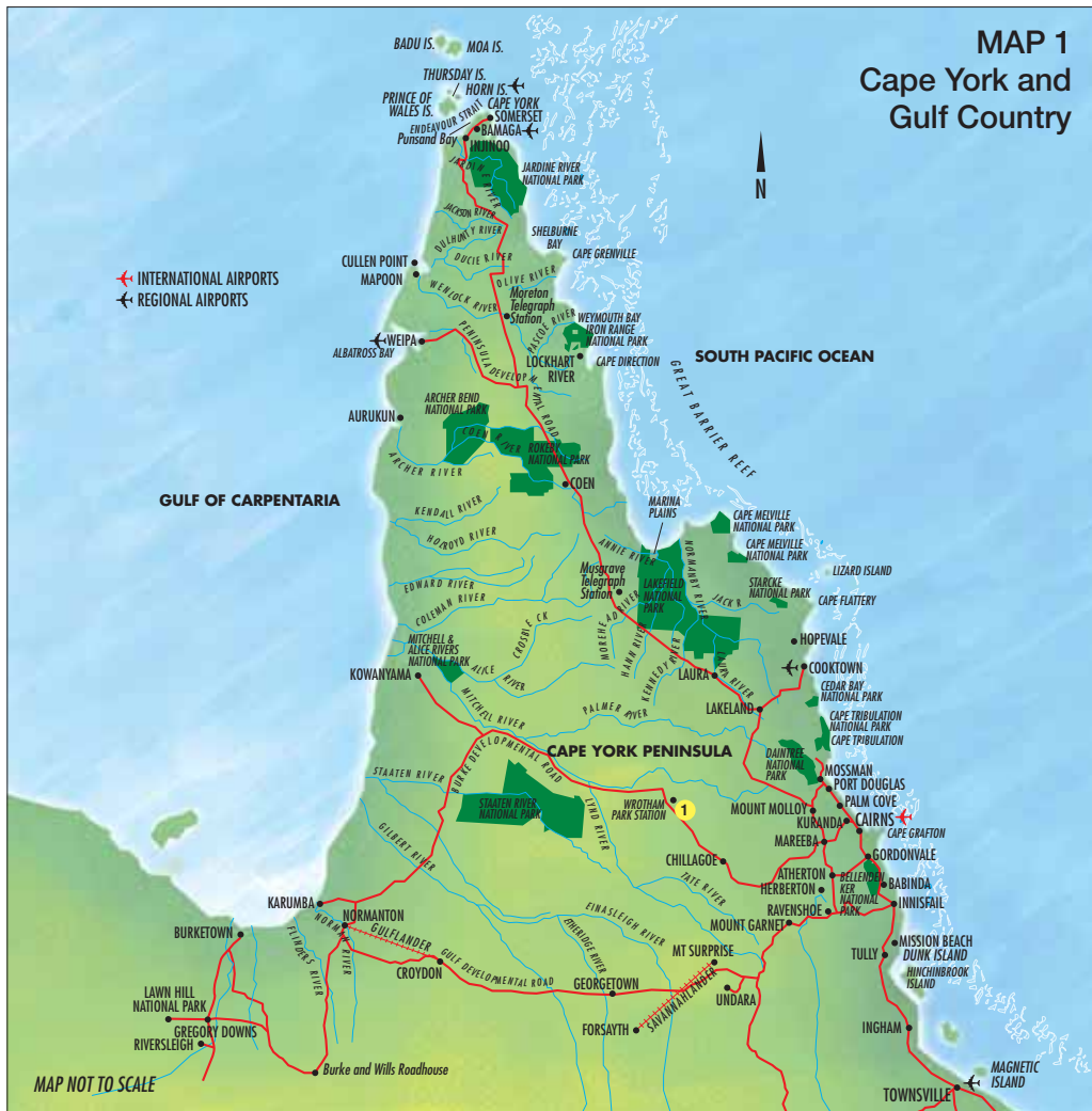
MAP 1 and 2