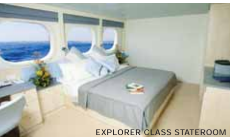
EXPLORER CLASS STATEROOM