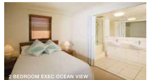
2 BEDROOM EXEC OCEAN VIEW