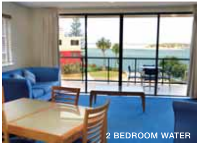
2 BEDROOM WATER

Shopping centre 20m Still water beach 50m Map 4 Page 42 Ref. 2