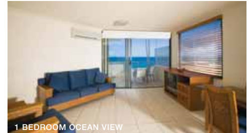
1 BEDROOM OCEAN VIEW