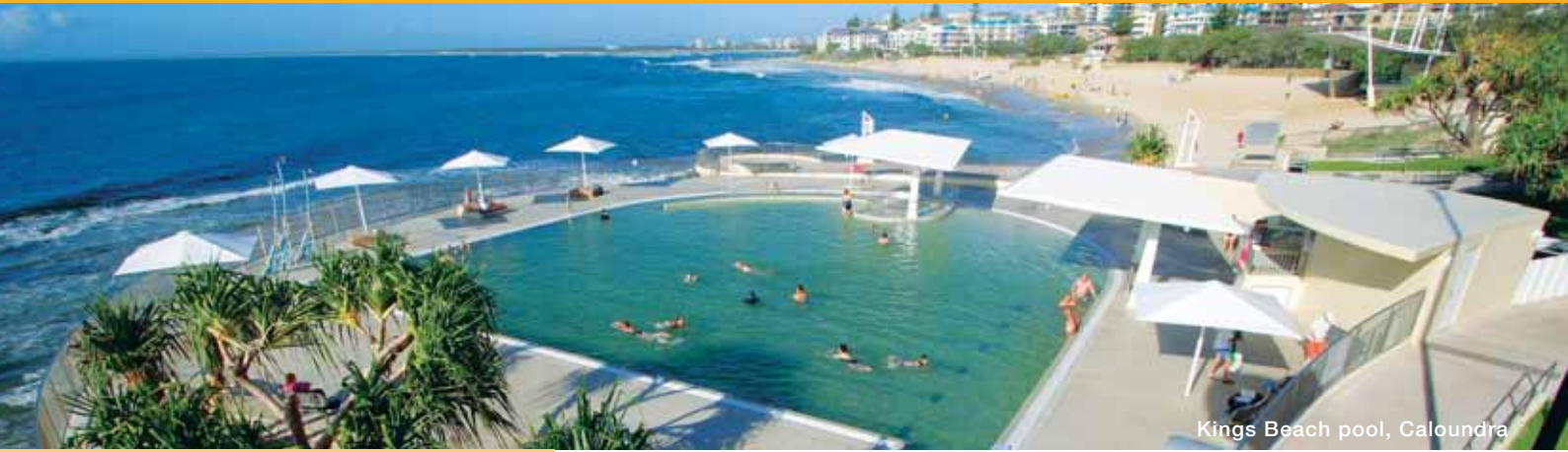
Kings Beach pool, Caloundra