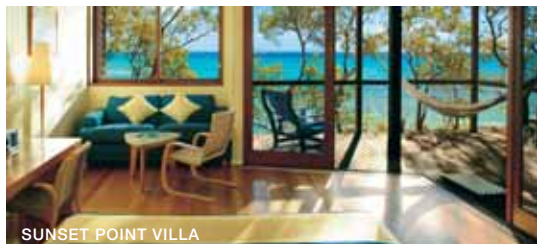
SUNSET POINT VILLA

Australia's northernmost resort, Voyages Lizard Island is located right on the Great Barrier Reef, fringed with coral reefs and 24 powdery white beaches. Outstanding in every respect, the unique pleasures of Lizard Island have created an idyllic island retreat.