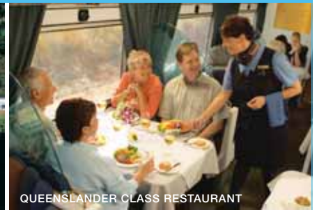
QUEENSLANDER CLASS RESTAURANT

Timetables, fares and details are subject to change without notice. Motorail service is only available on Brisbane to Cairns and Cairns to Brisbane services.