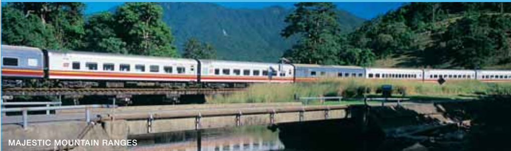
MAJESTIC MOUNTAIN RANGES

The Sunlander is one of Australia's most endearing rail journeys, weaving its way along Australia's incredible north-eastern coastline several times a week. It's a relaxing journey that runs between Queensland's tropical capital, Brisbane, and laid back Cairns. The Sunlander offers plenty of accommodation choices. For the budget conscious, choose from single, twin or triple berth sleeping compartments or seats.