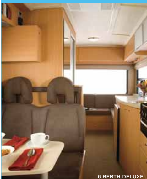
6 BERTH DELUXE

KEA's supremely comfortable 2, 4 and 6 berth, campervans, motorhomes and 4WDs are the perfect way to enjoy Australia's unique and beautiful environment, friendly people and relaxed lifestyle.