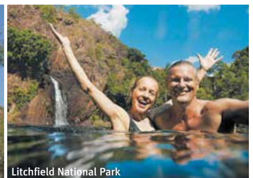
Litchfield National Park