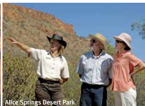
Alice Springs Desert Park