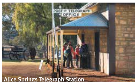
Alice Springs Telegraph Station

So no matter what type of rail holiday you're after, our packages are the perfect way to experience Australia's great rail journeys!