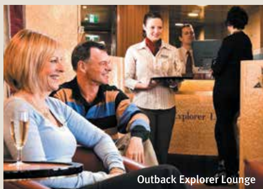
Outback Explorer Lounge

It takes a lifetime of experience to create the experience of a lifetime and for over 30 years, Sunlover Holidays has been creating great holiday experiences for families, for couples, for friends and for adventurers right around Australia.