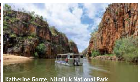
Katherine Gorge, Nitmiluk National Park