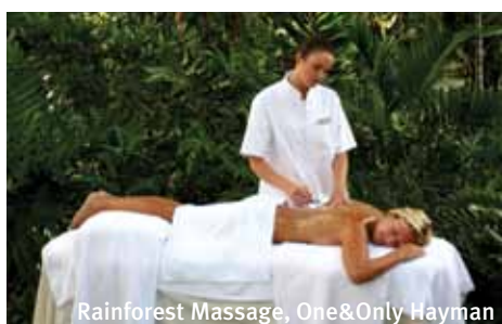
Rainforest Massage, One&Only Hayman