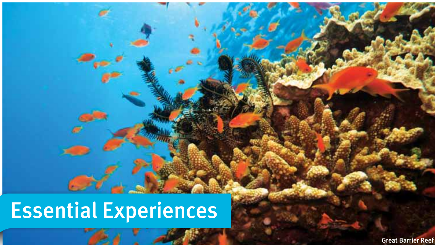
Great Barrier Reef