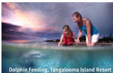
Dolphin Feeding, Tangalooma Island Resort

Treat yourself to a full pampering experience at Spa quaila on Hamilton Island and Rejuvenation Spa on Daydream Island. Immerse yourself in the beautiful surrounds at One&Only Hayman's Rainforest Massage, simply paradise! (see pages 26, 28 and 30 for details)