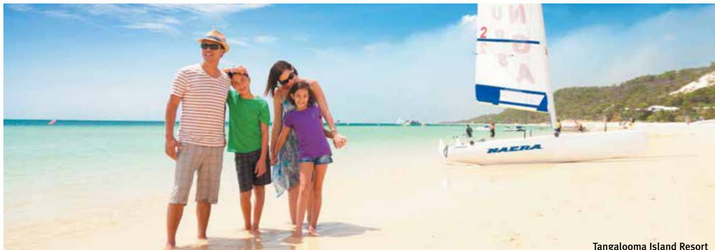
Tangalooma Island Resort