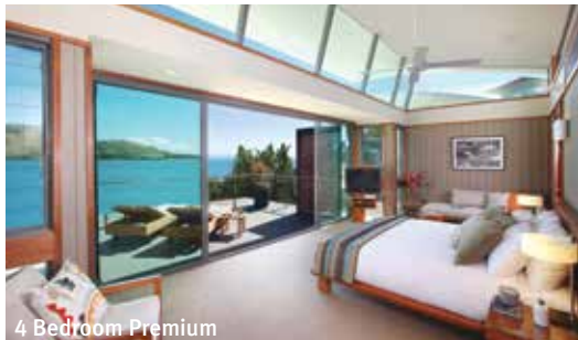
4 Bedroom Premium