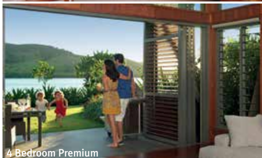
4 Bedroom Premium