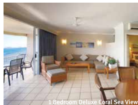
1 Bedroom Deluxe Coral Sea View

^ FREE Night Offer: Stay 5 nights, pay for 4. (5 night price includes 1 free night)