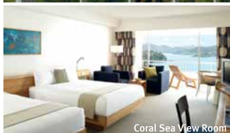
Coral Sea View Room