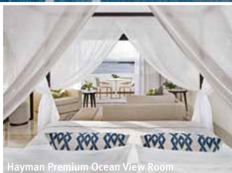
Hayman Premium Ocean View Room