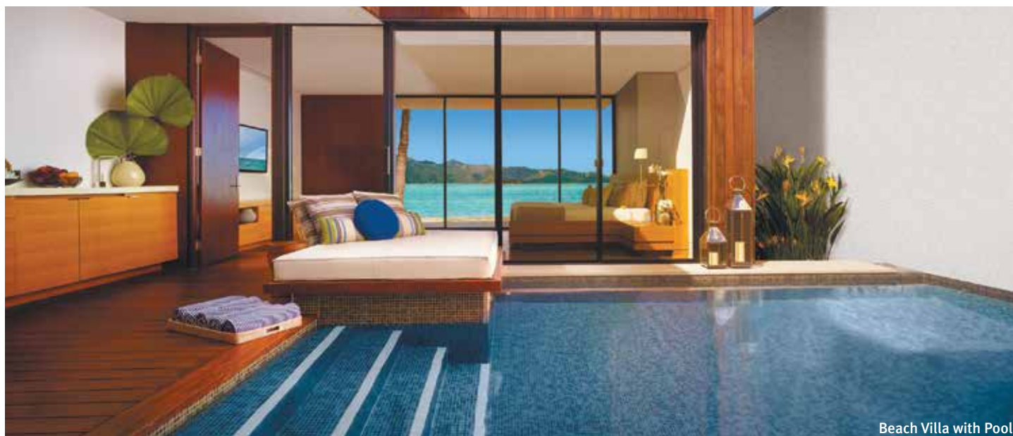
Beach Villa with Pool