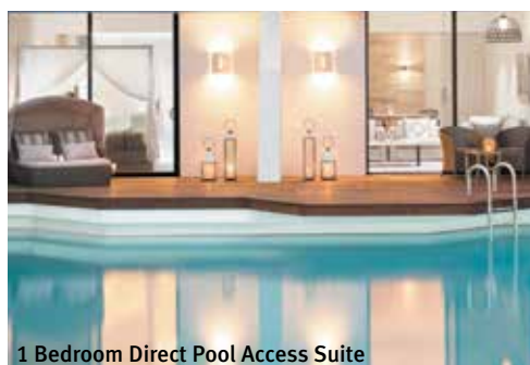
1 Bedroom Direct Pool Access Suite

Early Bird Offer: 20% discount applies for bookings made prior to 28 Feb 15, valid for travel 20 Apr – 27 May, 31 May – 15 Sep 15.