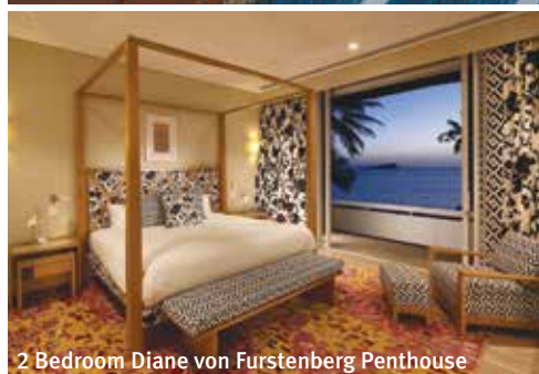
2 Bedroom Diane von Furstenberg Penthouse