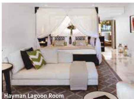
Hayman Lagoon Room