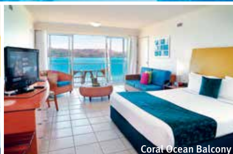
Coral Ocean Balcony