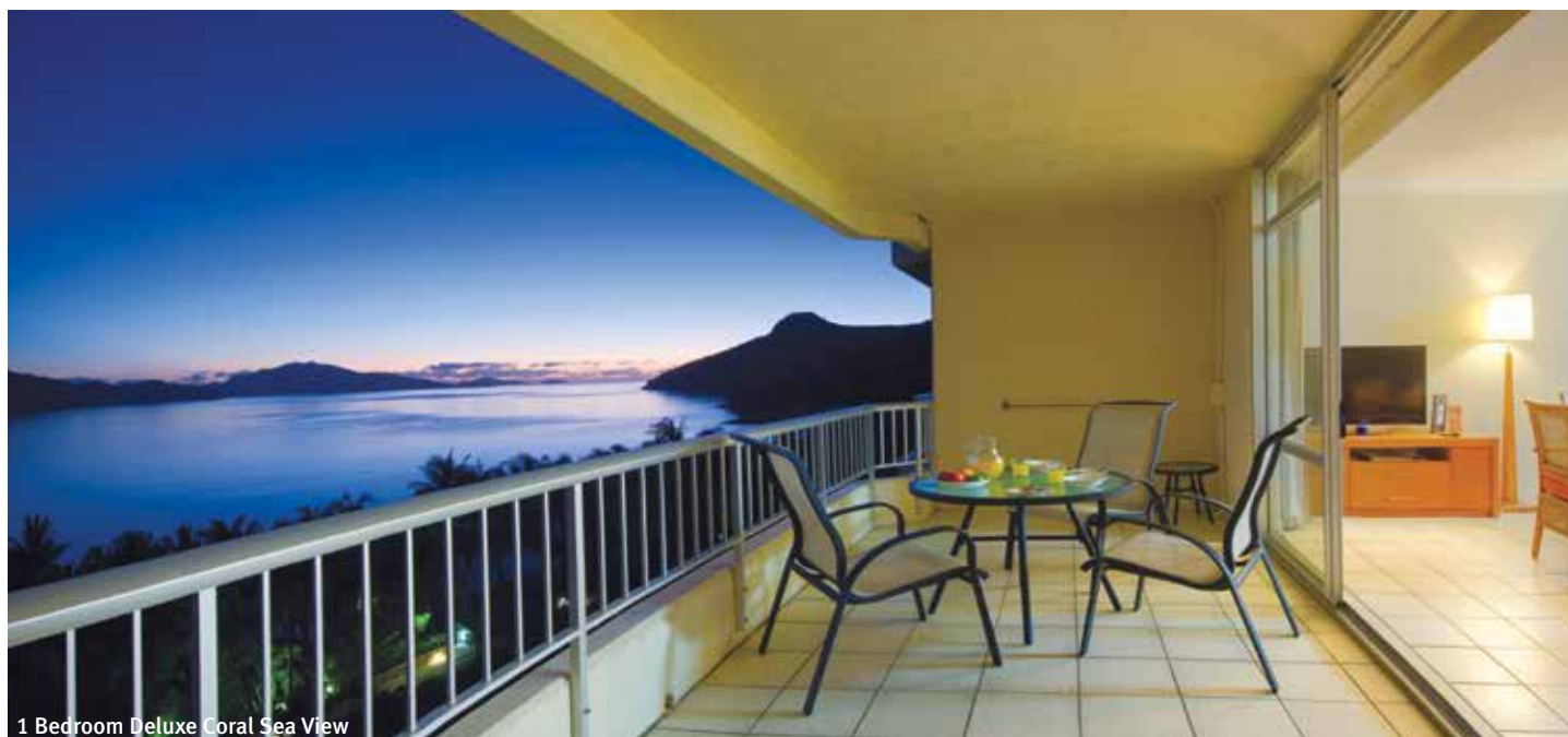
1 Bedroom Deluxe Coral Sea View