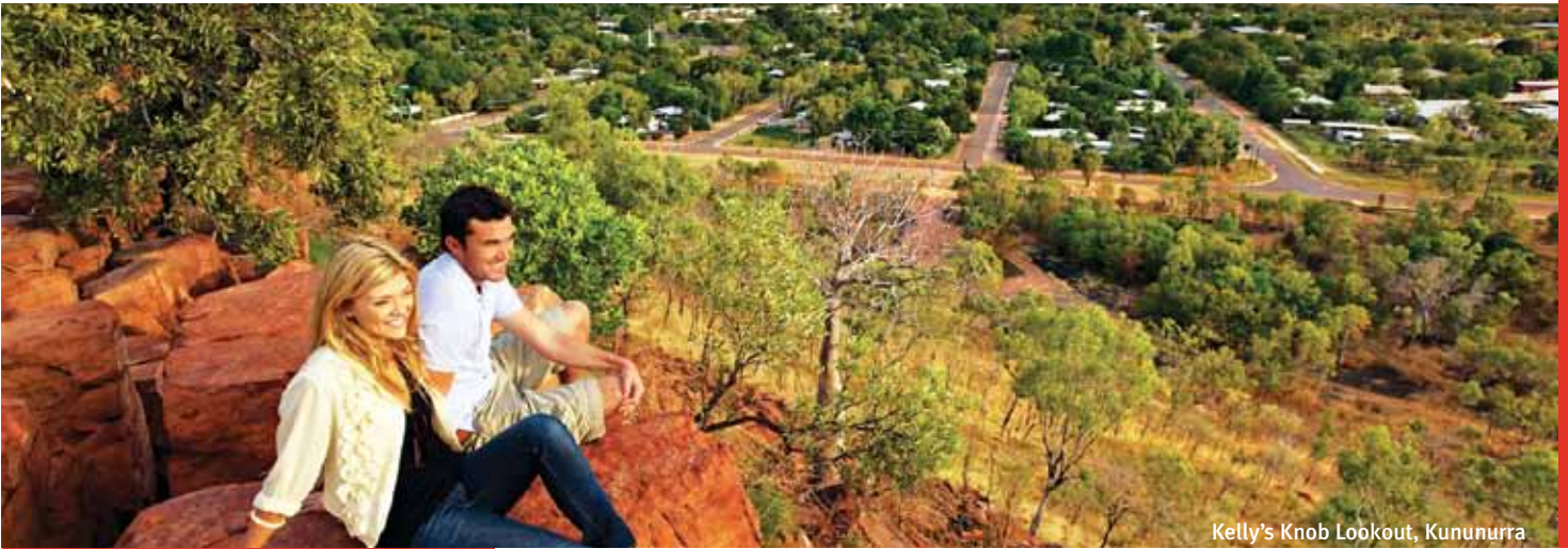
Kelly's Knob Lookout, Kununurra