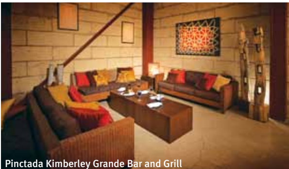
Pinctada Kimberley Grande Bar and Grill