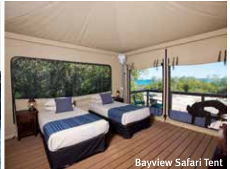
Bayview Safari Tent

BASED ON 5 NIGHT STAY From $170 PER ROOM PER NIGHT*