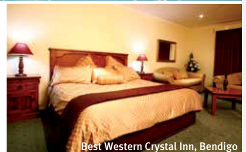
Best Western Crystal Inn, Bendigo