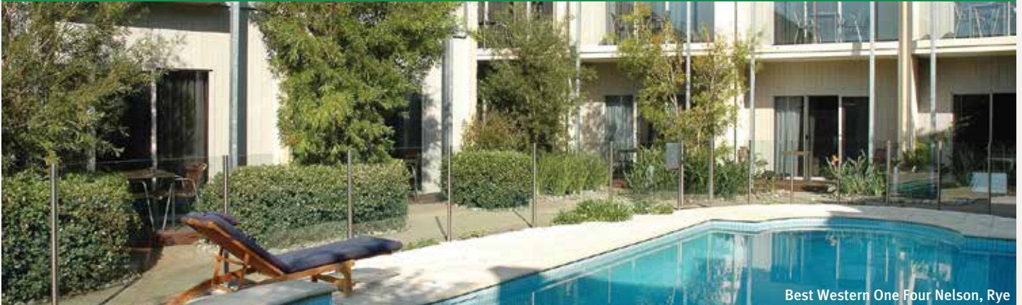
Best Western One Four Nelson, Rye

Best Western Australasia offers a comprehensive hotel pass program giving travellers flexibility and convenience for a pre-booked or 'go-as-you-please' holiday.