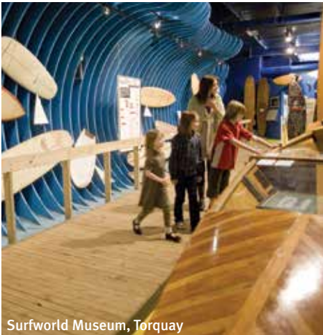
Surfworld Museum, Torquay