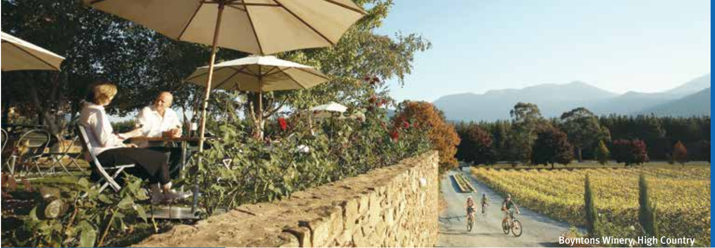
Boyntons Winery, High Country