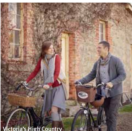
Victoria's High Country