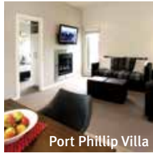
Port Phillip Villa

A family resort providing fantastic leisure facilities and activities with quality self-contained accommodation.