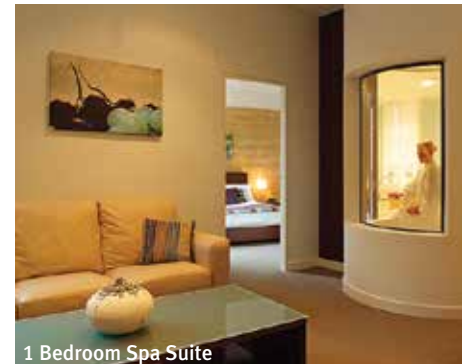
1 Bedroom Spa Suite