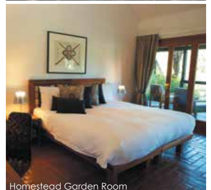
Homestead Garden Room