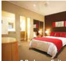
2 Bedroom Suite

Situated opposite Urangan Beach and its famous pier. This resort has unrestricted water views of the bay and Fraser Island.