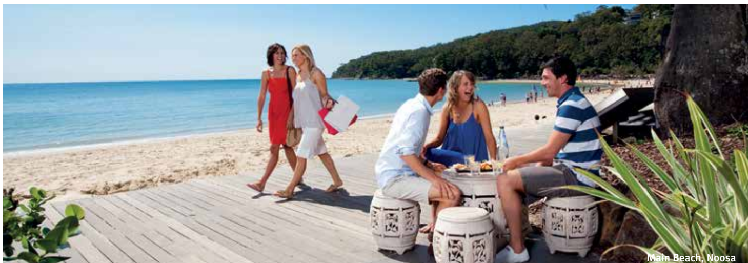
Main Beach, Noosa