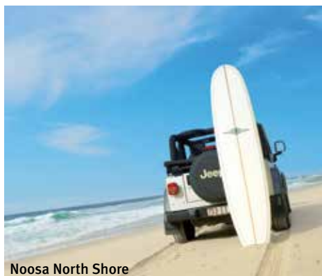
Noosa North Shore