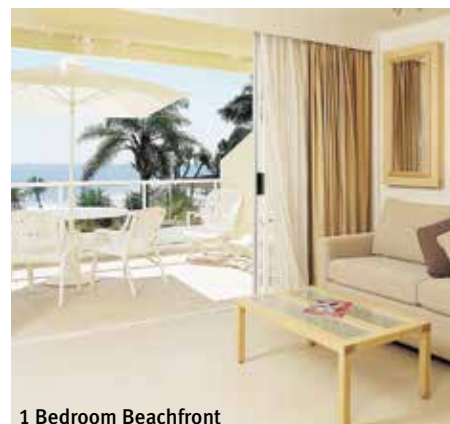
1 Bedroom Beachfront