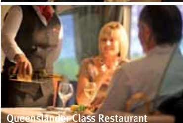
Queenslander Class Restaurant

There's nothing in the world to compare with the absolute beauty and contrasts of Queensland. And Queensland Rail Travel is the most relaxing way to experience all its fascinating places. Once you step on board The Sunlander and weave your way gently up the Queensland coast, you'll know what it's like to be transported to another world. Simply sit back and take in the breathtaking scenery between the vibrant cosmopolitan capital of Brisbane and the lush tropical paradise of Cairns. You can also relax in the comfort of knowing you'll be treated to something special on one of the World's Top 25 Rail journeys.