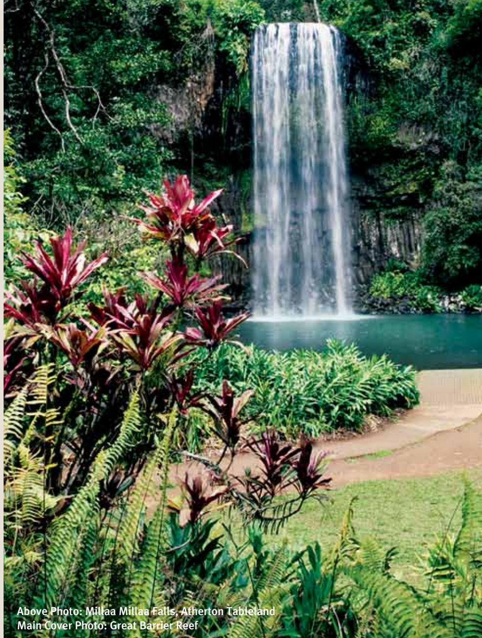
Above Photo: Millaa Millaa Falls, Atherton Tableland Main Cover Photo: Great Barrier Reef