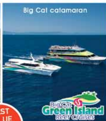
Big Cat catamaran