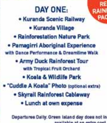
Rainforestation Nature Park