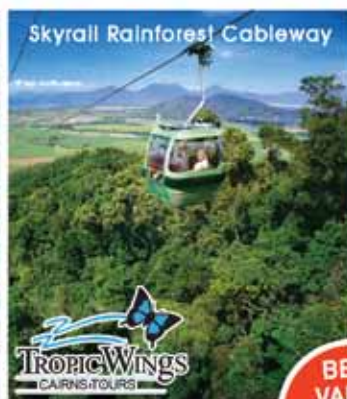
Skyrail Rainforest Cableway