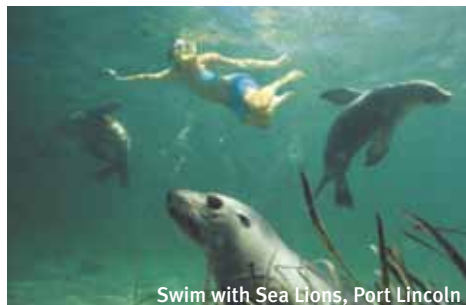
Swim with Sea Lions, Port Lincoln