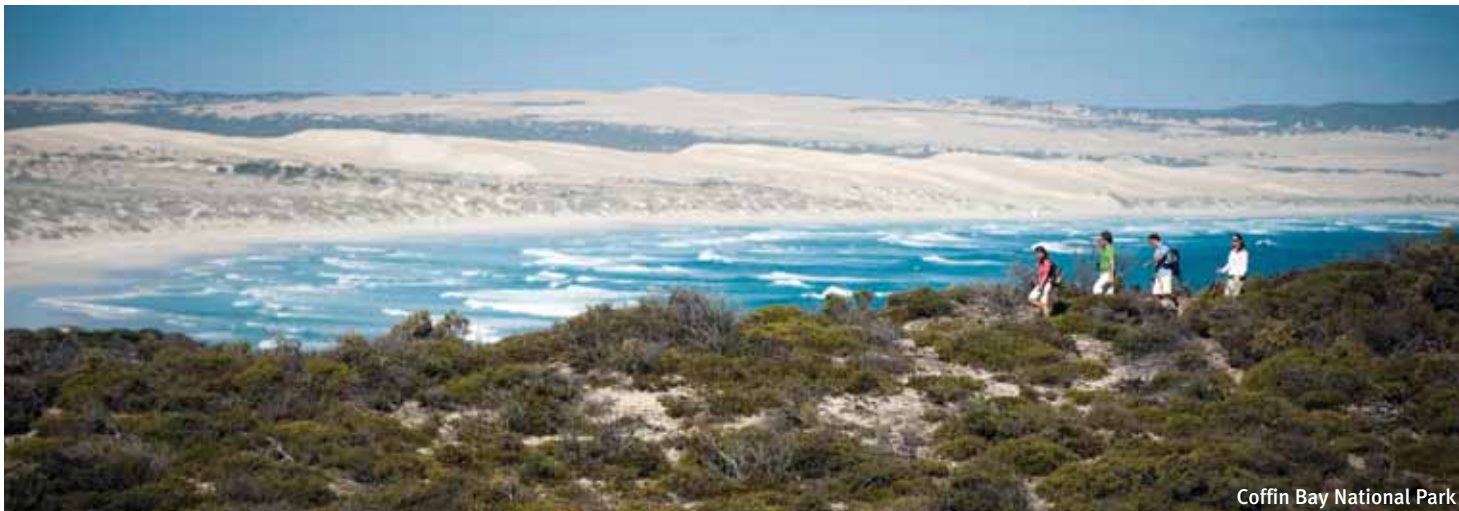
Coffin Bay National Park