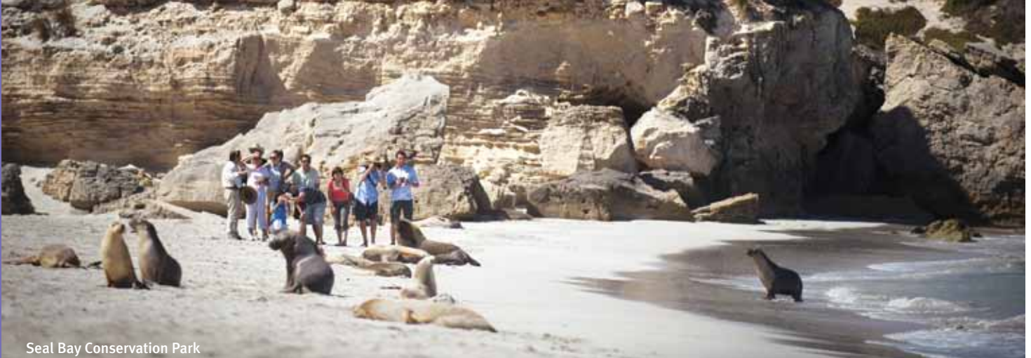
Seal Bay Conservation Park

Beautiful beaches to play on, great food and wine, spectacular scenery and wildlife encounters around every corner they're all here on Kangaroo Island. Accessible by ferry from Cape Jervis or by plane from Adelaide, visit for a day or stay for a while.