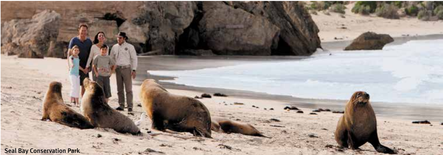
Seal Bay Conservation Park