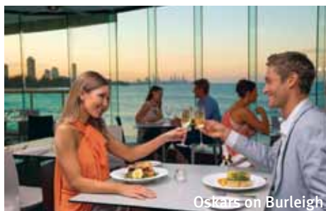
Oskars on Burleigh

Stroll through the famous Surfers Paradise sign and along Cavill Avenue for an iconic Gold Coast experience. Lined with shops, nightclubs, bars and restaurants, the street also features surf art and regular live music performances.