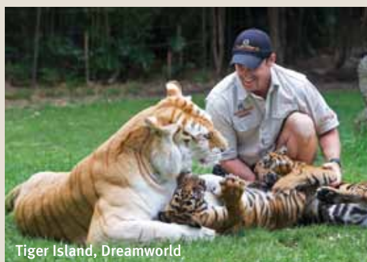
Tiger Island, Dreamworld