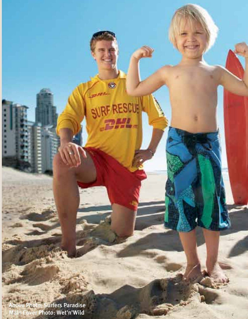
Above Photo: Surfers Paradise Main Cover Photo: Wet'n'Wild