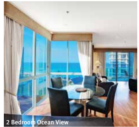
2 Bedroom Ocean View