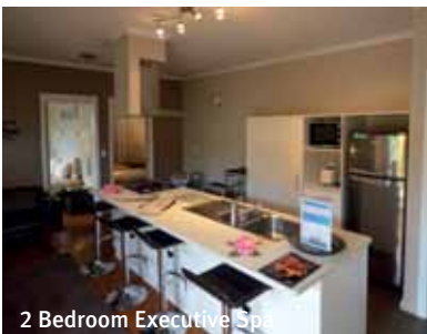
2 Bedroom Executive Spa