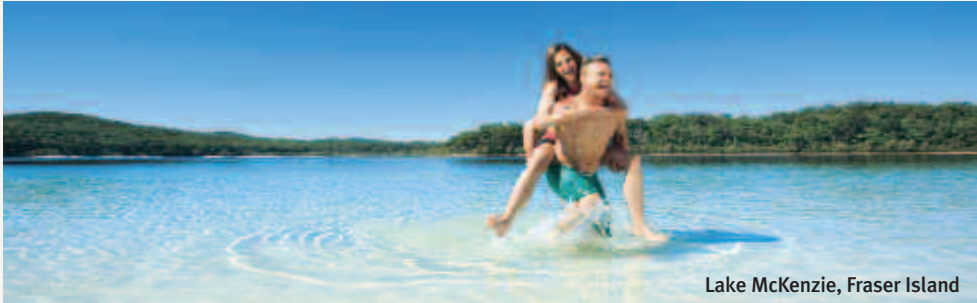
Lake McKenzie, Fraser Island

Where else but Queensland will you find a heavenly stretch of surf and sand, a breathtaking hinterland and access to natural treasures like World Heritage Listed Fraser Island.