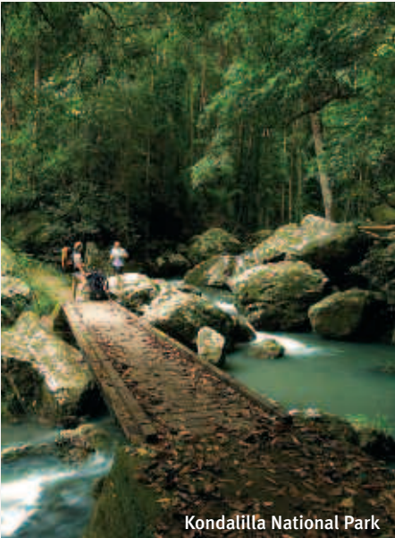
Kondalilla National Park

Where else but Queensland will you find a heavenly stretch of surf and sand, a breathtaking hinterland and access to natural treasures like World Heritage Listed Fraser Island.