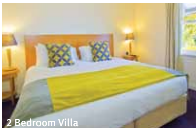
2 Bedroom Villa