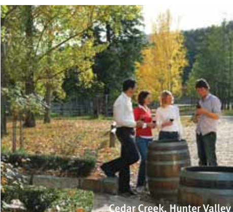
Cedar Creek, Hunter Valley