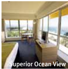
Superior Ocean View

Located beachfront 90 minutes south of Sydney, featuring spectacular ocean and mountain views.