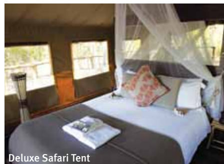
Deluxe Safari Tent