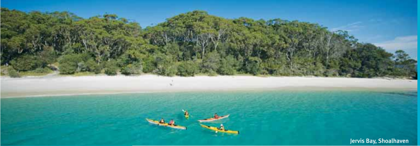
Jervis Bay, Shoalhaven