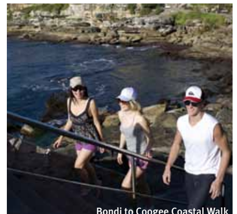
Bondi to Coogee Coastal Walk