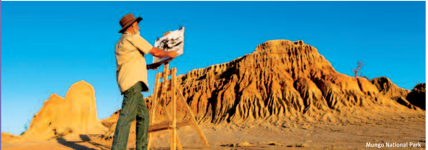
Mungo National Park

There's so much to discover in New South Wales. The scenery alone will get you hooked, from national parks full of wildlife to the mountains and a coastline fit for endless seaside exploration.