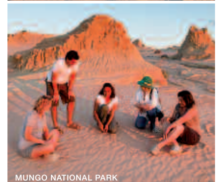
MUNGO NATIONAL PARK