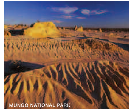
MUNGO NATIONAL PARK