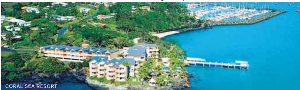
CORAL SEA RESORT