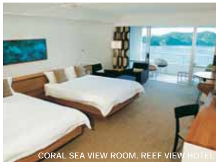
CORAL SEA VIEW ROOM, REEF VIEW HOTEL

Enjoy this truly unique and exclusive Great Barrier Reef experience for a maximum of six guests. Reefsleep is the only place in Australia where you can 'sleep on the reef'. Located 51 nautical miles from the mainland, Reefsleep gives you the chance to watch the marine life really come to life as the sun goes down. Pop the champagne and enjoy the most spectacular sunset. Feast on a gourmet dinner under the canopy of a million stars. Combine this with a stay on Hamilton Island, with its village atmosphere, shopping, extensive range of activities and myriad of eateries. A truly unforgettable holiday.