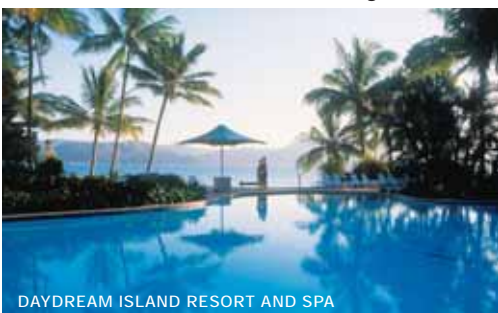
DAYDREAM ISLAND RESORT AND SPA