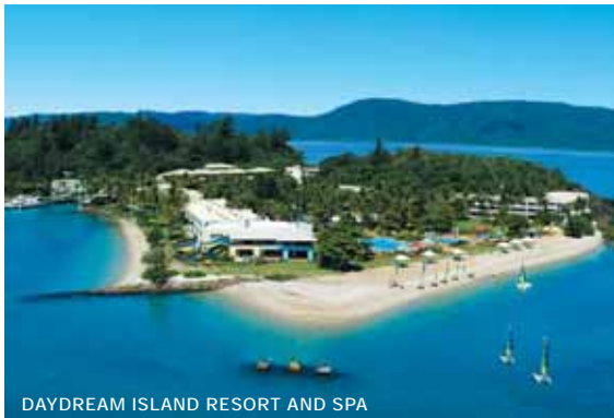
DAYDREAM ISLAND RESORT AND SPA