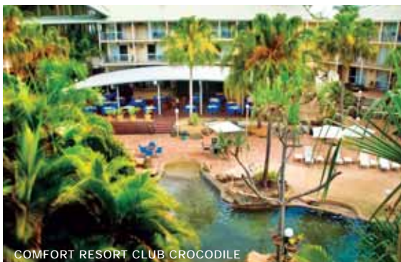
COMFORT RESORT CLUB CROCODILE