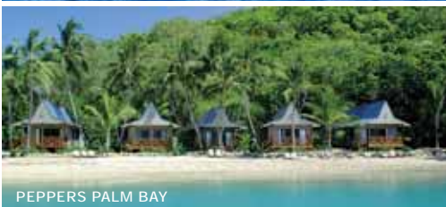
PEPPERS PALM BAY

This unique holiday combination offers an intimate and secluded accommodation retreat with a superior sailing escape.