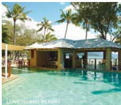
LONG ISLAND RESORT

Why not experience the best of both worlds by combining Long Island Resort, a great fun, all inclusive holiday experience with the atmosphere of an oasis style resort, Comfort Resort Club Crocodile.